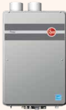
Rheem Manufacturing Co.'s Prestige Series condensing tankless gas water heaters include a water savings setting that can save up to 1,100 gallons per year.

Bradford White offers a wealth of water-heating options. The High Efficiency Bradford White Infiniti Tankless Water Heater Series, for example, includes a method of pre-heating incoming cold water. The result is a continuous supply of hot water. These water heaters not only supply endless amounts of hot water, but they do so in a way that is good for the environment in