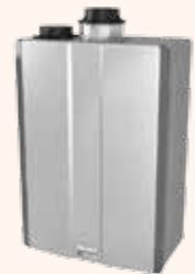
Rinnai Corp.'s Ultra Series RUR98i and RUR98e models have various features to recirculate water. The result: less waiting, less waste and endless hot water wherever and whenever it's needed for showers, sinks and appliances.