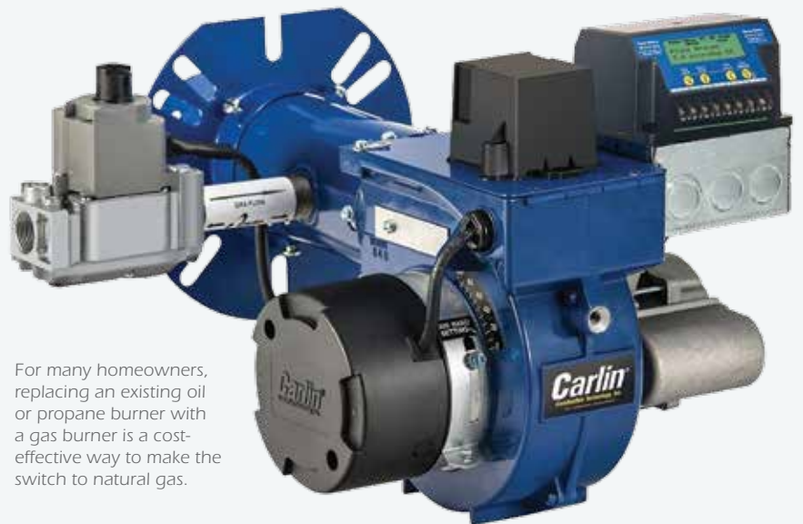
For many homeowners, replacing an existing oil or propane burner with a gas burner is a cost-effective way to make the switch to natural gas.

“It is essential that the combustion testing be done so that the unit functions properly and safely,” Graham said. “Customers should make sure the contractor has combustion testing equipment. Some contractors may